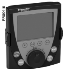
Remote graphic display terminal