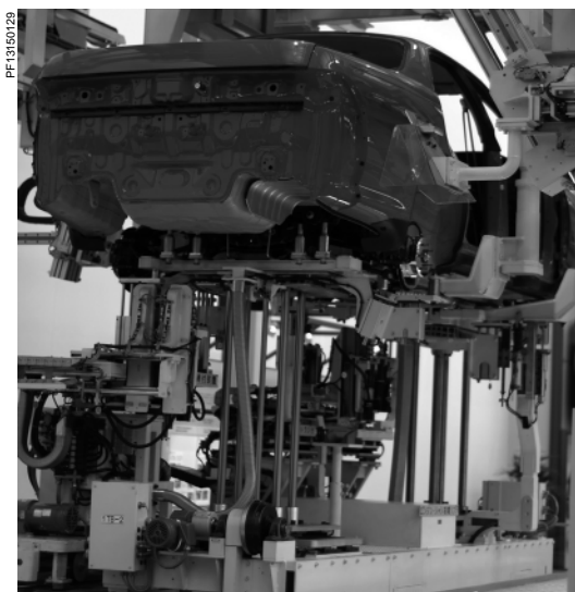
Application: material handling