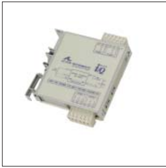
Q510-0xxx (2 Channel) Q510-4xxx (4 Channel)